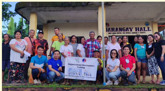
Abad Santos Farmers Association, Santa Monica – March 24