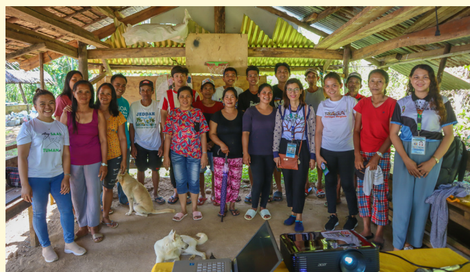
California Farmers Association (CFA), Tagana-an – April 13