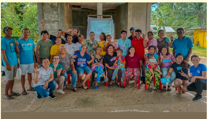
Union SAAD Farmers Association (USFA), Tagana-an – March 23