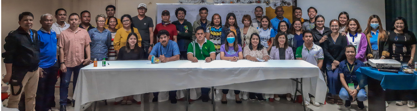
Pre-implementation meeting with Phase 2 LGUs in Surigao del Norte and Agusan del Norte, March 1

Recognizing the crucial participation of the local government in advancing community agricultural development and farmers' welfare, the Program met with 14 partner Municipal Agricultural Office (MAO) to present guidelines, projects and shortlisted farmers' associations (FAs) during the provincial consultation meeting from March 1 to 2, 2023.