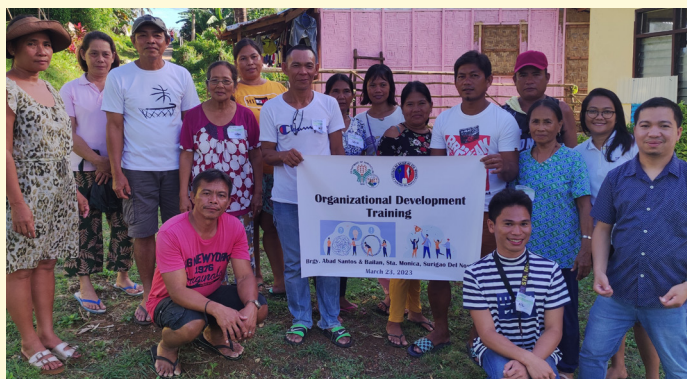
Bailan Farmers Entrepreneurs Association, Santa Monica – March 23