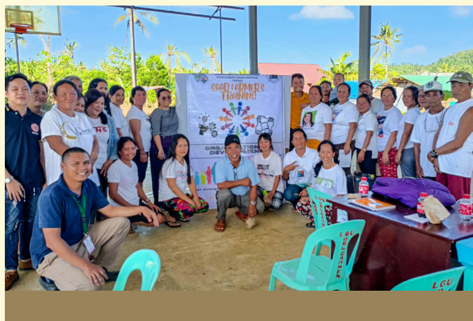
Malipayon ug Mauswagong Mag-uuma sa Mahayahay, Del Carmen – March 22