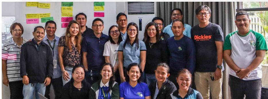
Program staff and eight partner LGUs participated in the workshop that delved into community organizing, functions, and roles of community organizers and managing new organizations, February 14.