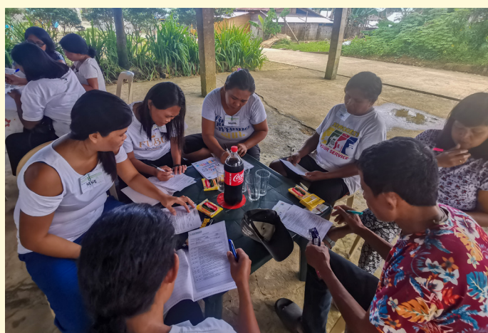
United Del Pilar Farmers Association, San Isidro – March 27