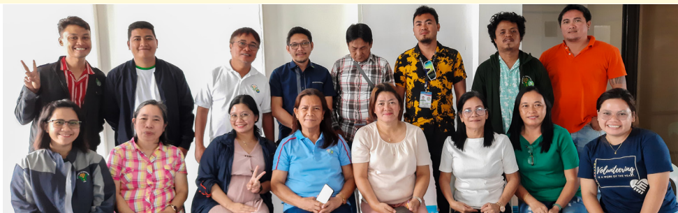
Pre-Implementation meeting with Phase 2 LGUs in Dinagat Islands, March 2

Program implementers discussed with Provincial and Municipal Agricultural Officers their roles