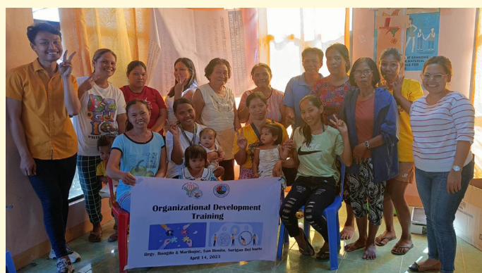
Bongdo SAAD Farmers Organization, San Benito – April 14