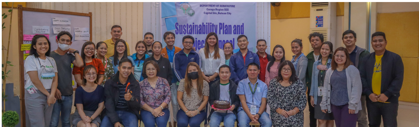
SAAD Phase 1 implementers gathered to craft a turn-over plan of livelihood projects in Agusan del Sur and Surigao del Sur, January 19.

Ensuring the sustainability of Phase 1 implemented projects, Department of Agriculture - Special Area for Agricultural Development (DA-SAAD) Program Caraga staff and stakeholders mapped out a Project Sustainability and Project Exit Plan on January 19, 2023 at VCDU Convention Center, Butuan City.