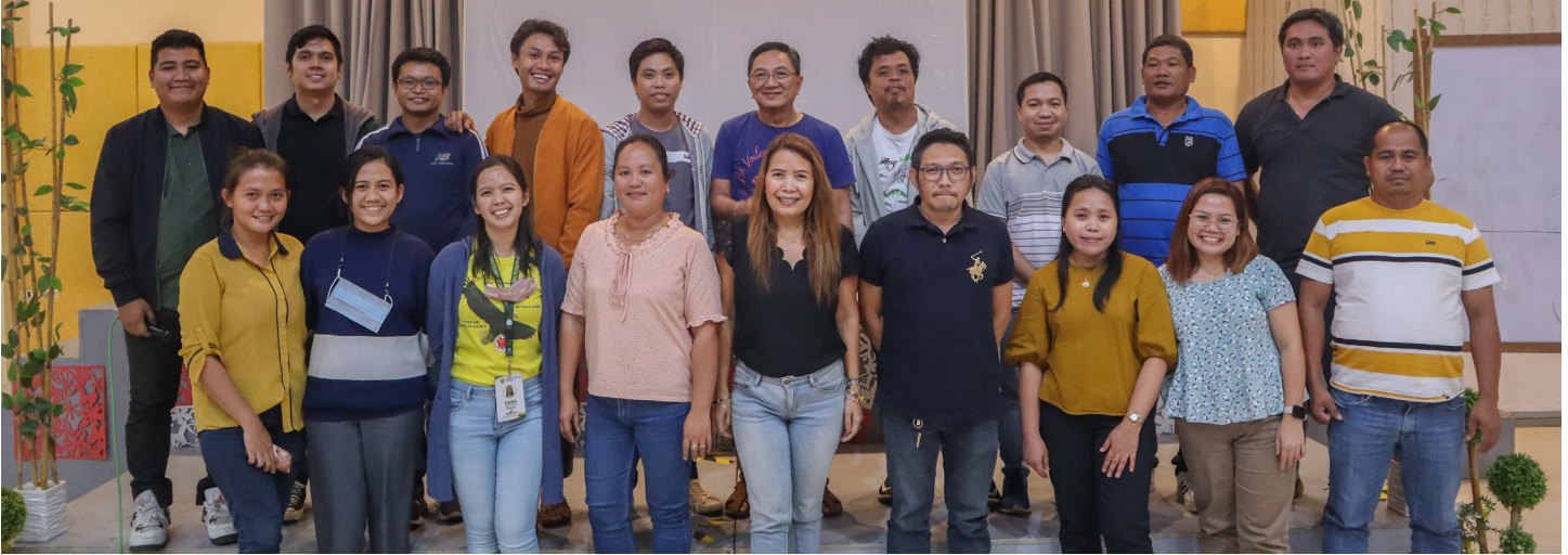
21 technical staff and Phase 2 LGUs participated in the workshop that tackled basic steps in preparing a project proposal and complementary tools to project planning, January 20.

To enrich staff and partners' planning and technical writing skills and develop project proposals appropriate and responsive to recipients' needs, the Department of Agriculture - Special Area for Agricultural Development (DA-SAAD) Caraga conducted Project Proposal Workshop on January 20, 2023, at VCDU Prince Convention Center, Butuan City.