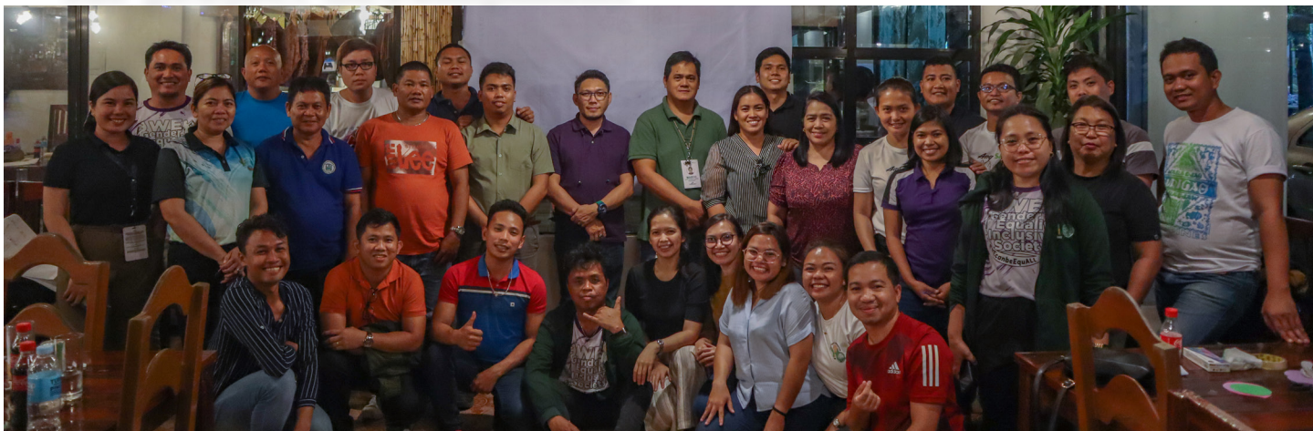
SAAD Caraga cascaded PRA and tools introduced by National Office to staff and Phase 2 LGUs in a training in General Luna, SDN, March 29-30.

Aiming for improved farmers' active involvement and collaboration, the DA Special Area for Agricultural Development (SAAD) Program capacitated staff and local government units in conducting Participatory Rural Appraisal (PRA) on March 29-30, 2023, in General Luna, Surigao del Norte.