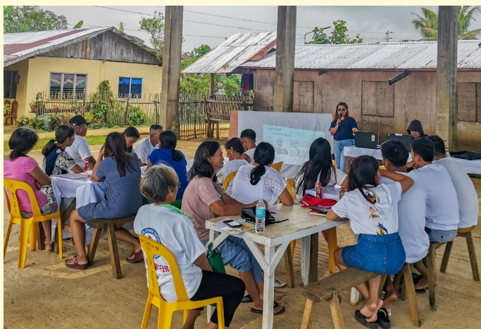
San Miguel United Farmers Association, San Isidro – March 28