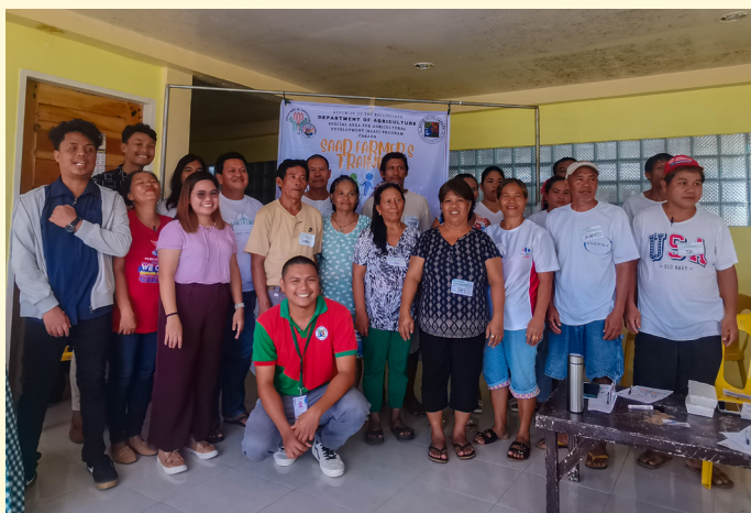
Makugihong Mag-uuma sa Katipunan, Del Carmen - March 21