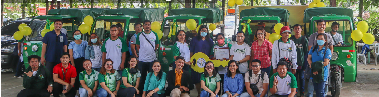
6 farmers' organizations awarded with delivery vehicles as additional support to sustain their community-based enterprises post SAAD Phase 1 support, January 27.

To strengthen market linkage and sustain delivery of product lines, the Department of Agriculture - Special Area for Agricultural Development (DA-SAAD) Program Caraga awarded delivery vehicles to six (6) assisted farmers' associations (FAs) in a formal turnover at the Regional Office, Butuan City on January 27, 2023.