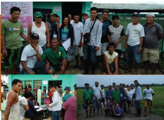
March 21, 2017 | PR Photograph

Department of Agriculture – Special Area for Agricultural Development (DA-SAAD) Eastern Samar staff meet with rice farmer-beneficiaries of Brgys. 01, 06, and 03, Quinapondan to orient, profile, and geotag their farm lands on March 8, 2017. ### (Jhomai Canlas)