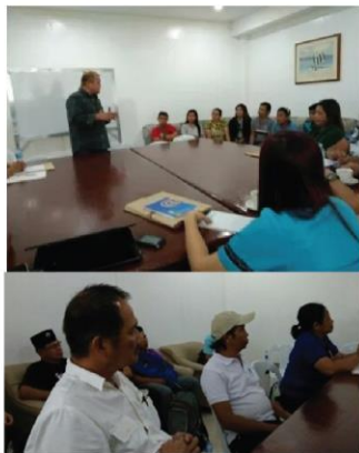
March 28, 2017 | PR Photograph