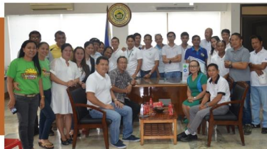
March 29, 2017 | PR Photograph