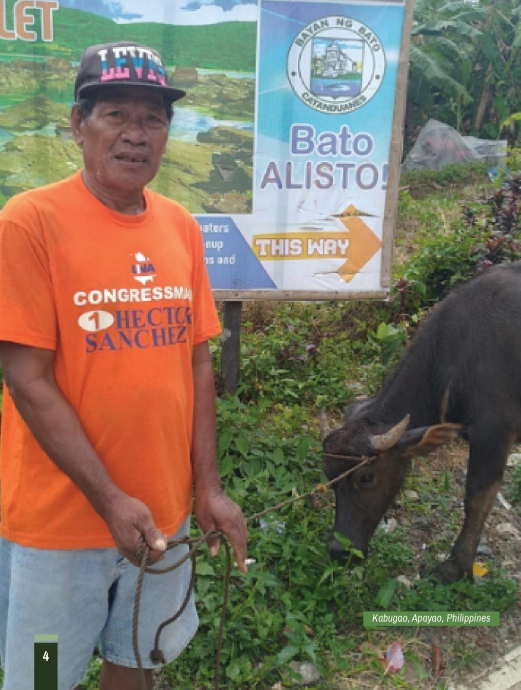
Kabugao, Apayao, Philippines